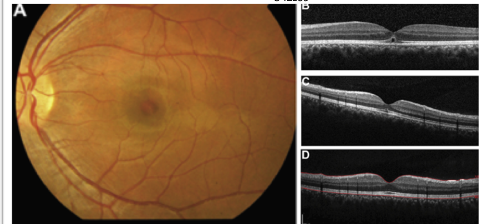
FIGURE 1 – A – Color fundus photograph of the left eye demonstrating pigmentary foveal changes following laser pointer exposure. B – Macular OCT scan demonstrating disruption of the IS/OS junction and RPE. C – Macular OCT scan 1 month post exposure with partial resolution. D- Macular OCT scan 2 months post exposure with complete resolution.

A comprehensive systemic review was performed. A review of 23 papers which document laser pointer exposure to 54 eyes from the last 5 years were identified. Key word search terms included “laser pointer maculopathy” and “macular laser injury”.