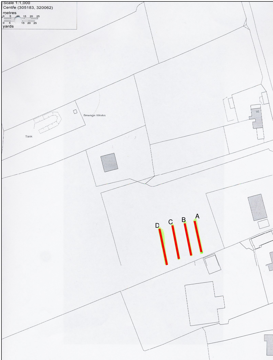
Fig. 3: Location of test trenches (marked in red).