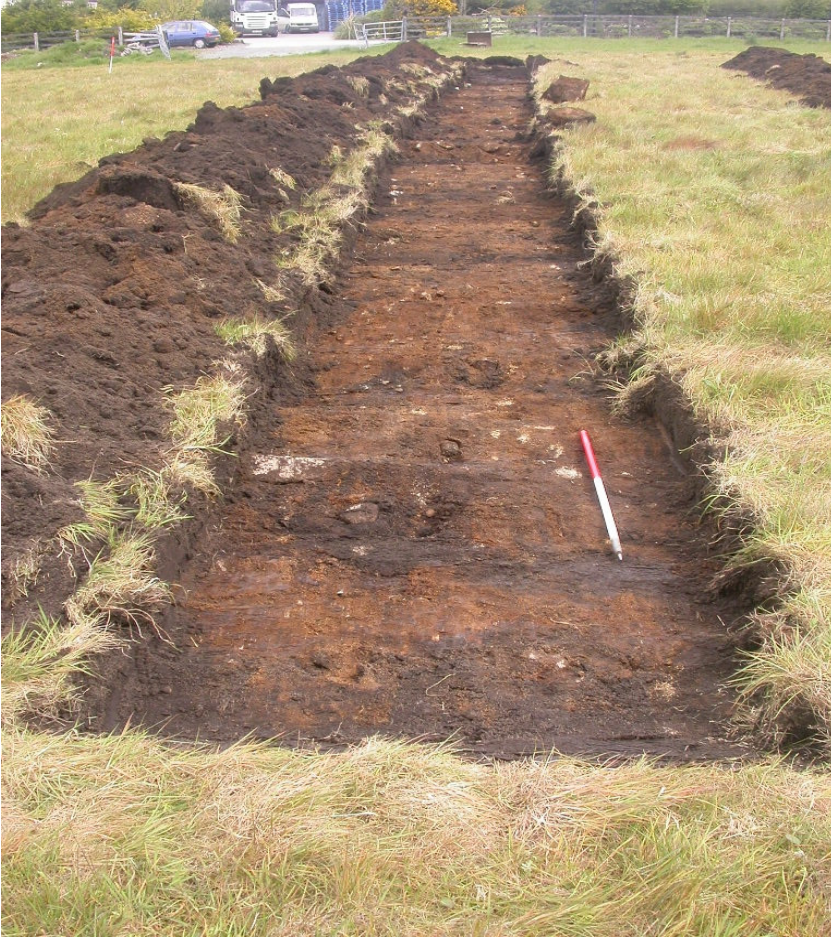
Plate 5: View of Trench C from the south, after excavation to surface of subsoil (C302).