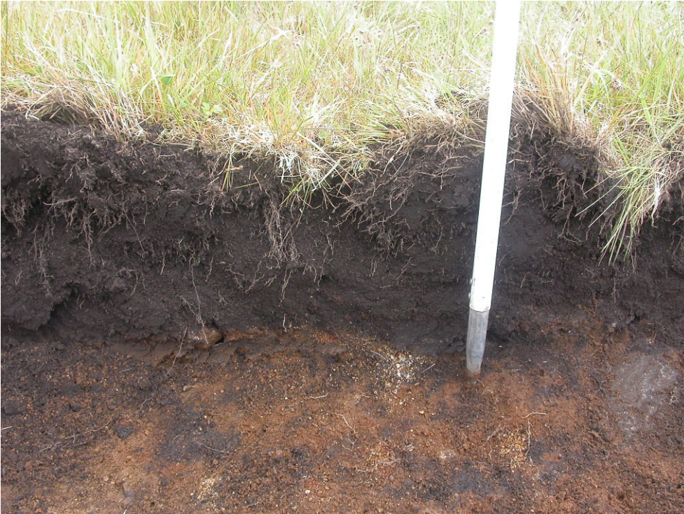
Plate 6: View of west-facing section in Trench C, after excavation to surface of subsoil (C302).