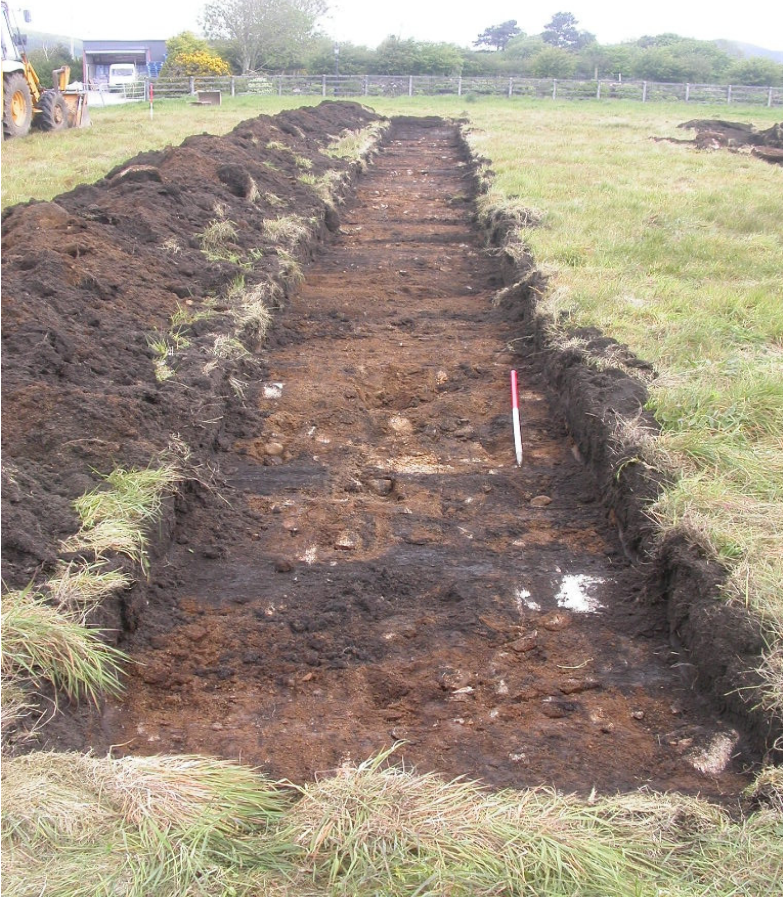
Plate 3: View of Trench B from the south, after excavation to surface of subsoil (C202). Some relict traces of topsoil remain where stones prevented full excavation, these were investigated by hand to ensure no archaeological features or deposits were obscured.