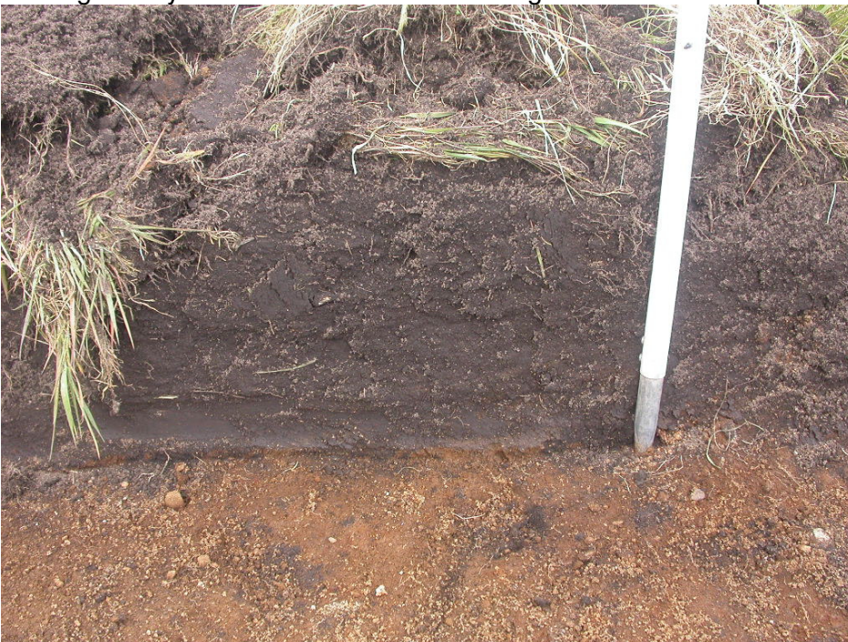
Plate 4: View of west-facing section in Trench B, after excavation to surface of subsoil (C202).