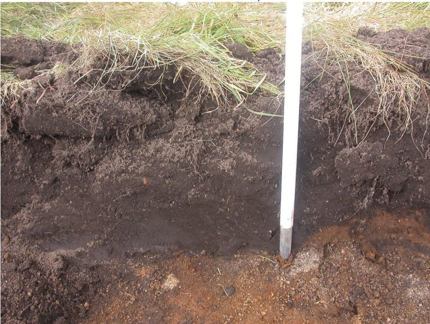
Plate 2: View of west-facing section in Trench A, after excavation to surface of subsoil (C102).