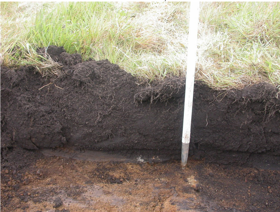
Plate 8: View of west-facing section in Trench D, after excavation to surface of subsoil (C402).