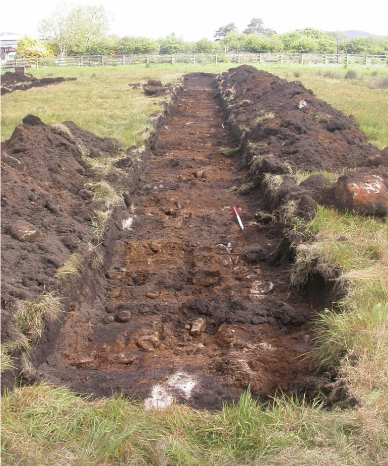
Plate 1: View of Trench A from the south, after excavation to surface of subsoil (C102).