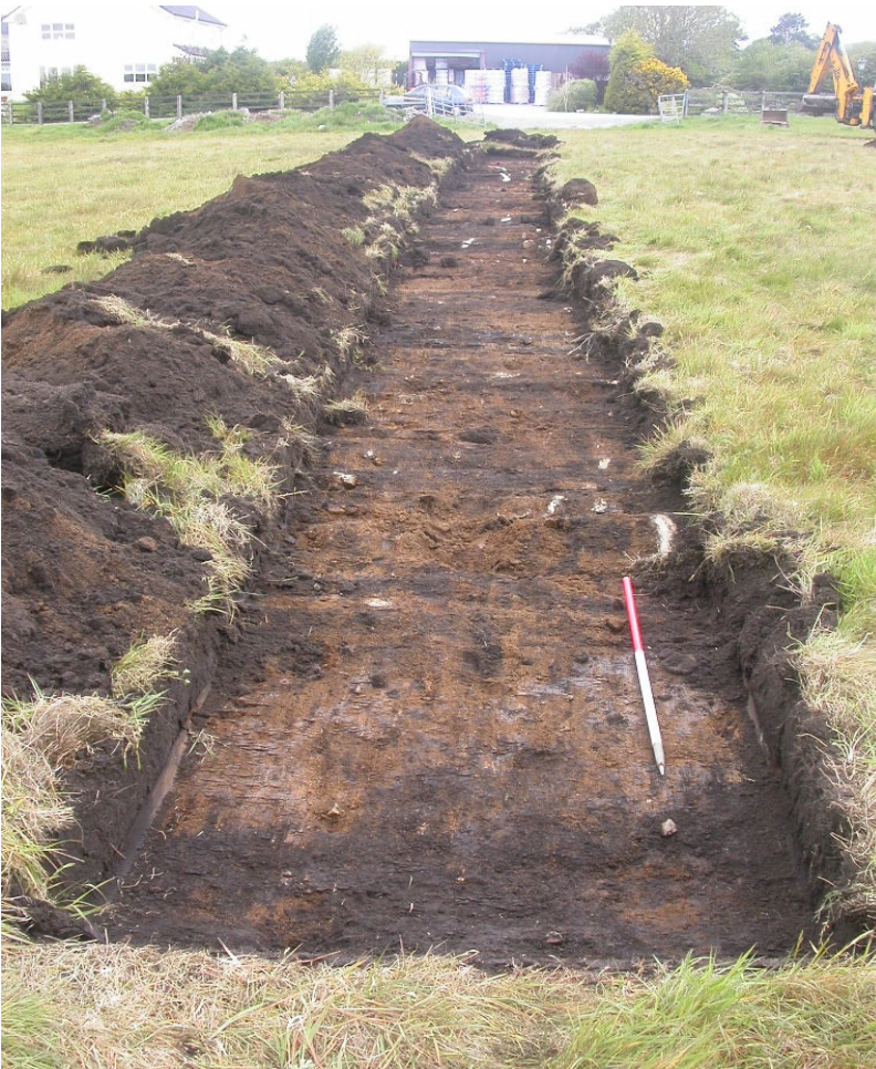
Plate 7: View of Trench D from the south, after excavation to surface of subsoil (C402).