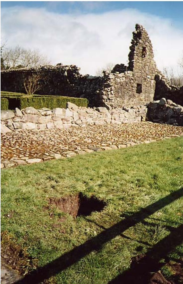
Plate 3: Trench post-excavation, looking north-east.