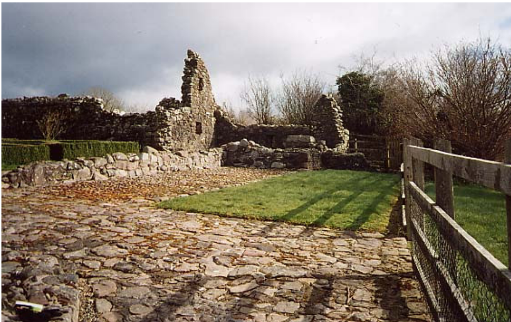
Plate 1: Location of trench pre-excitation, looking north-east towards south-east flanker.