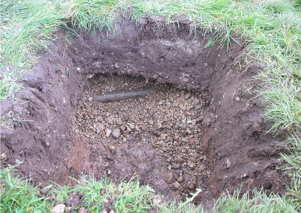
Plate 2: Trench showing plastic pipe in gravel (Context 103), looking east.