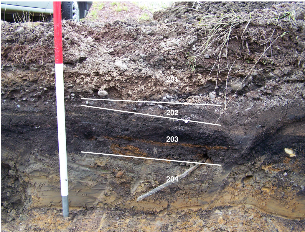
Fig. 5 – North facing section of Trench 2 showing contexts encountered.

Trench 2 lay immediately to the north of Trench 1 (Fig. 3) and was located taking into account the known underground location of a drain and telephone cables as well as the presence of a concrete path which runs around the southern limit of the dwelling. The trench measured 16m long and 2m wide and was orientated approximately east west. A layer of topsoil and hardcore (C201; Fig. 5), around 0.30m thick, was removed and lay above a layer of mid-brown loamy soil (C202) which was around 0.10m thick. Below C202 was a dark grey, charcoal rich layer (C203) which had a thickness of around 0.25m. This burnt soil lay directly above the light orange brown natural clay (C204).