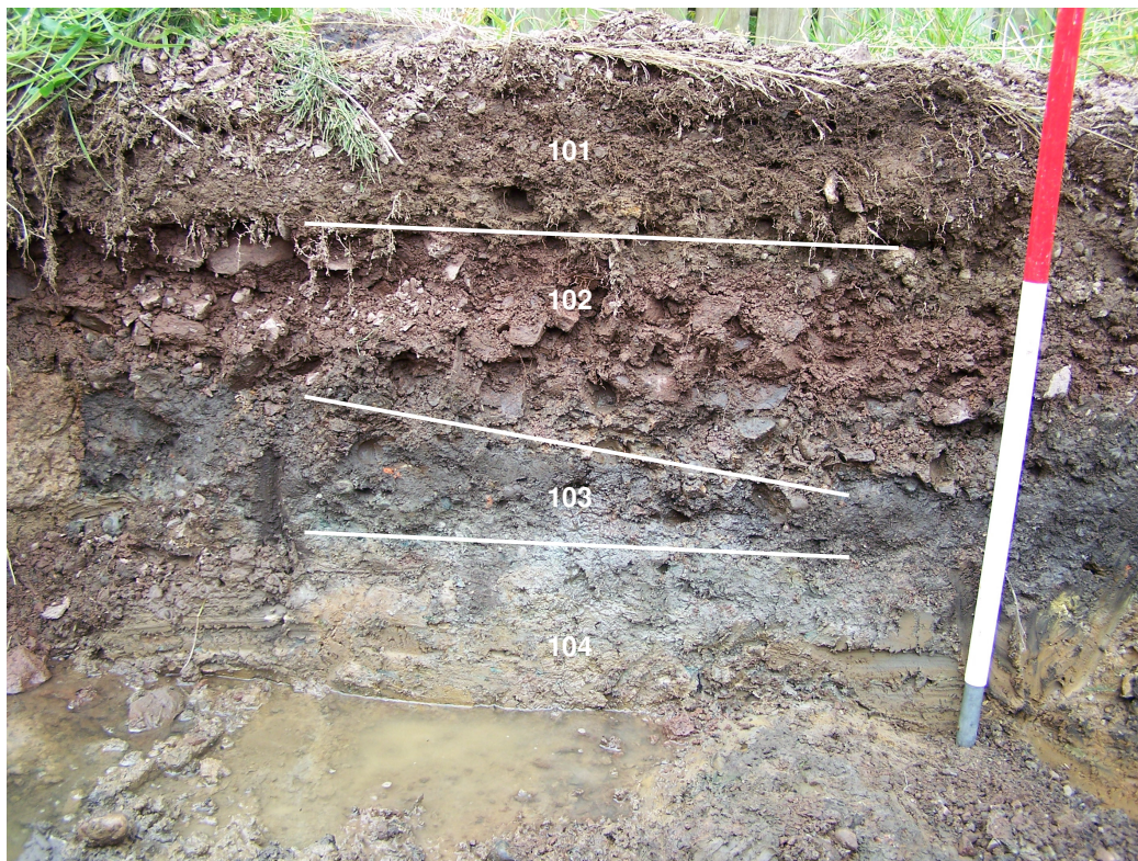
Fig. 4 – East facing section in Trench 1 showing the contexts encountered.