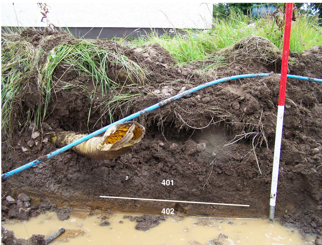
Fig. 8 – North facing section of Trench 4.