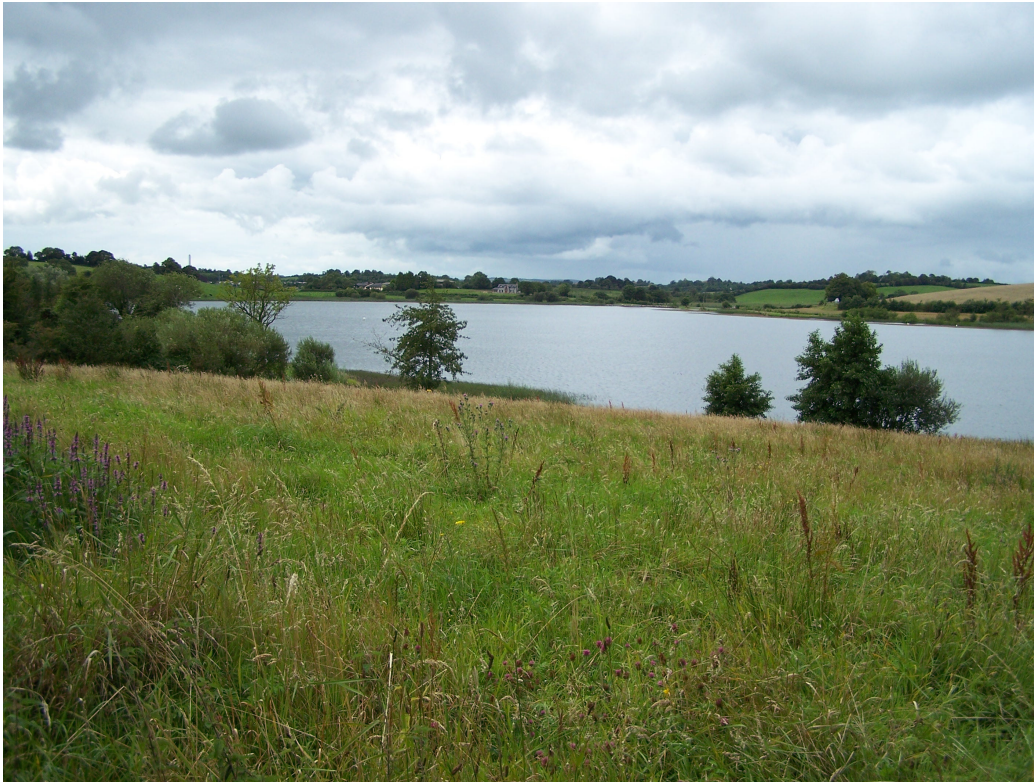
Fig. 2 – Looking south west from Trench 1 at Lough Eskragh, site of Late Bronze Age occupation activity.