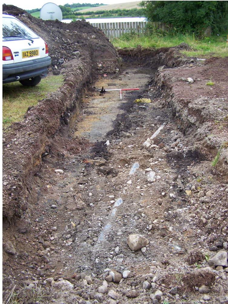
Fig. 6 – Trench 2, looking west towards Lough Eskragh, contexts 201, 202 and 203 removed to reveal the natural clay (C204) and a modern storm drain.

Apart from the storm drain and a tree root stump, the natural clay was undisturbed and nothing of archaeological significance was uncovered.