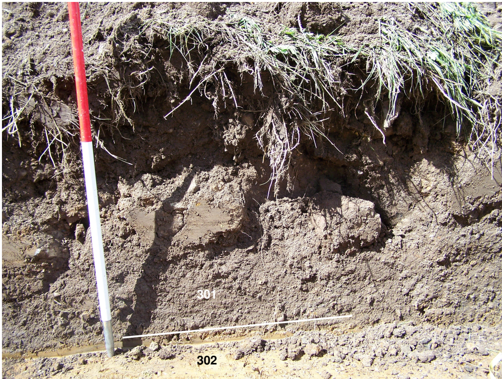
Fig. 7 – East facing section of Trench 3.