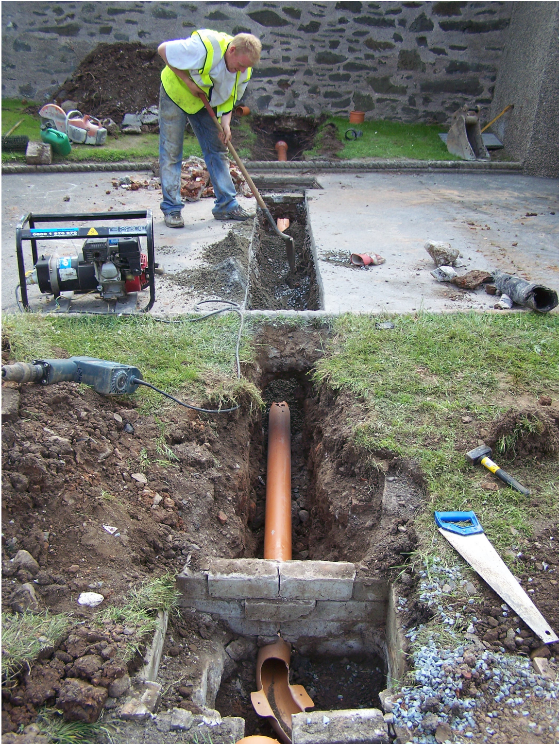
Photo 1: Excavated trench with replacement pipe running up to wall of Hillsborough Fort