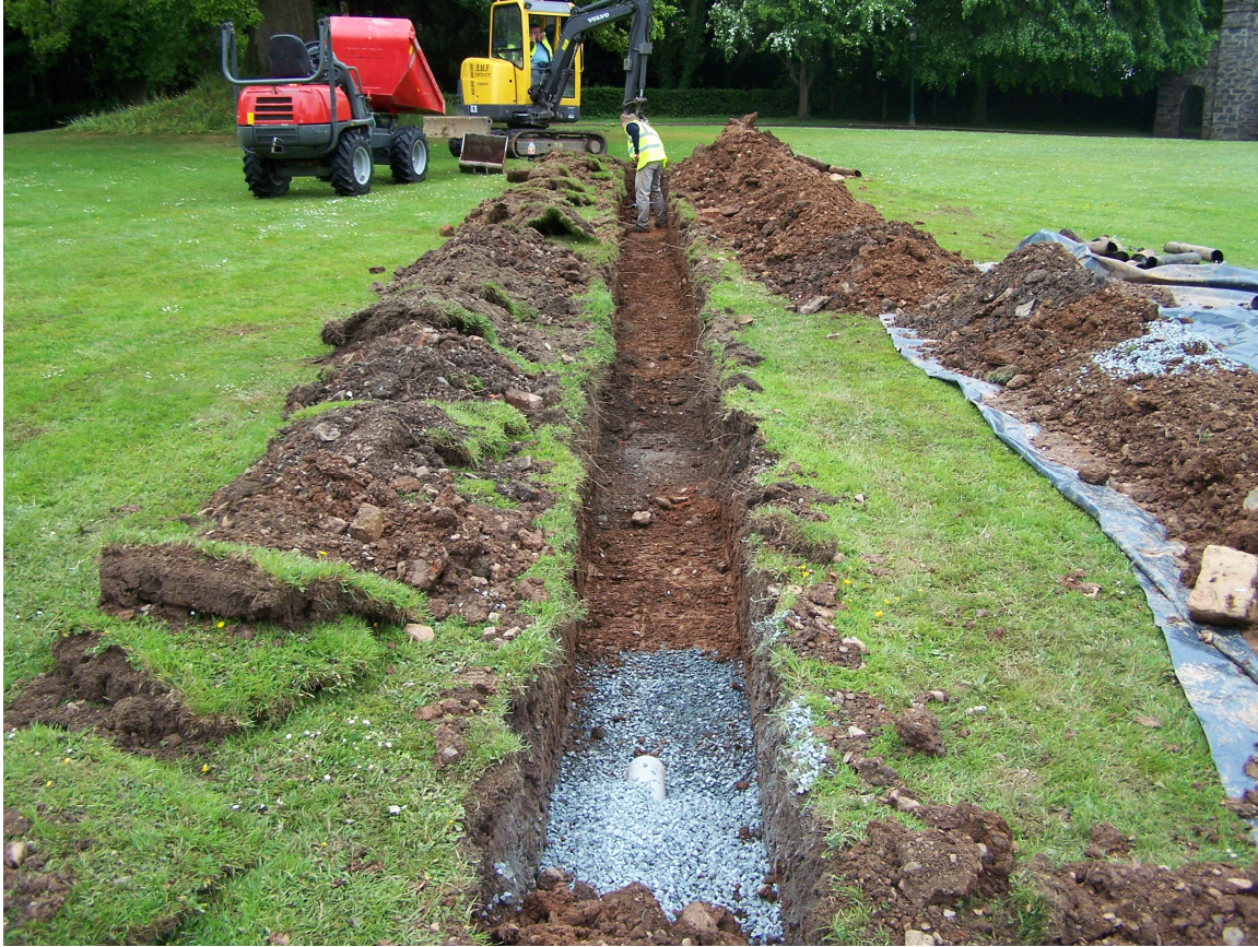
Photo 2: Excavation of trench for replacement pipe running across lawn at Hillsborough Fort.