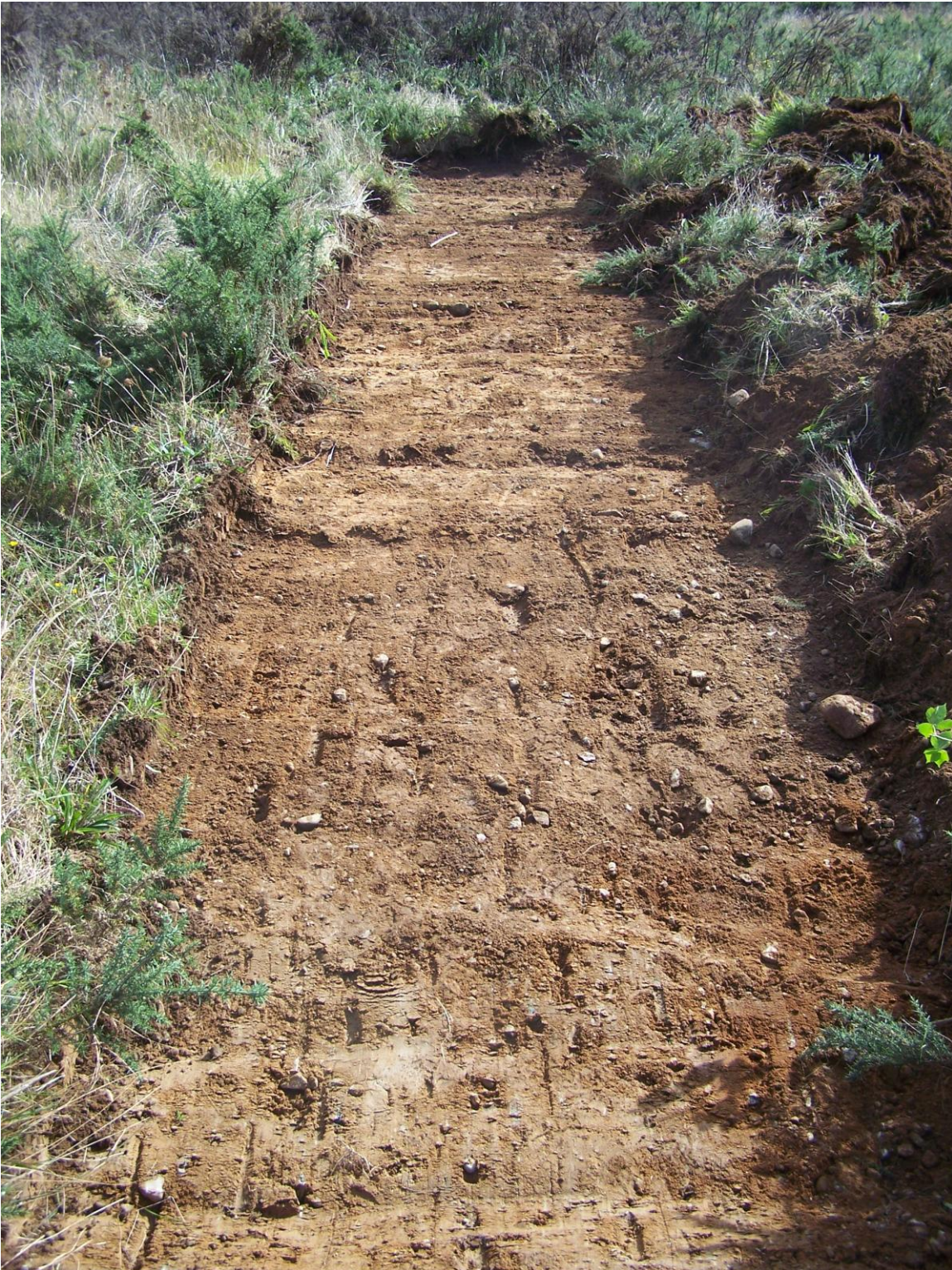
Plate 3: Trench 3 following excavation to the natural subsoil (Context No. 302), looking south-east.