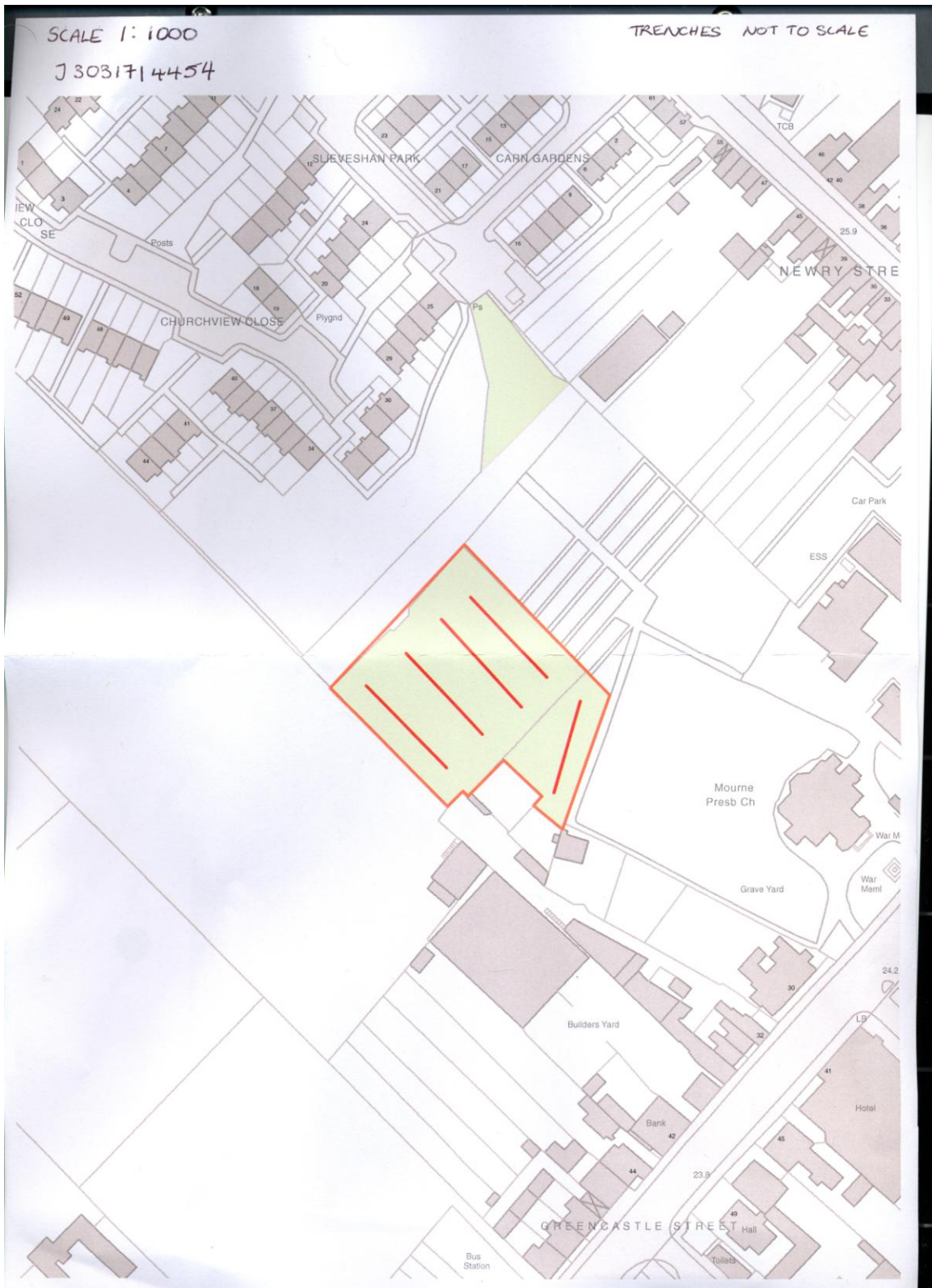
Fig. 3: Detailed location map showing application site (highlighted in red) and approximate location of test trenches.