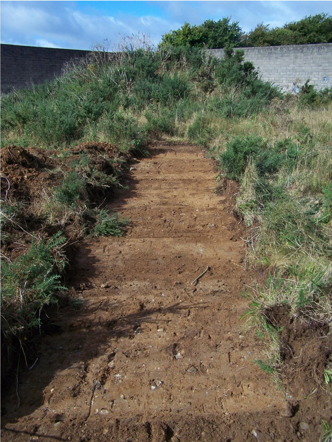
Plate 4: Trench 4 following excavation to the surface of the natural subsoil (Context No. 402), looking north-west.