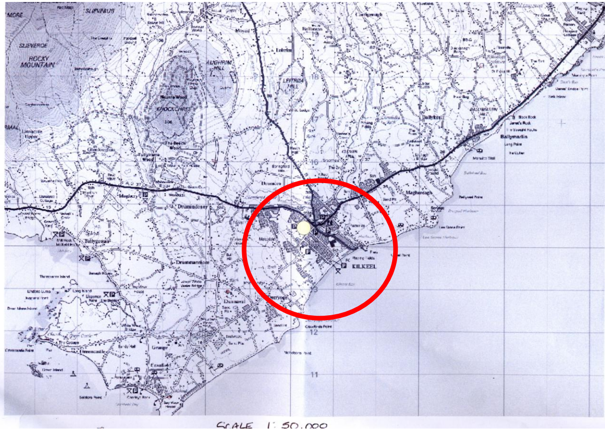
Fig. 1: General location map showing Kilkeel (circled).