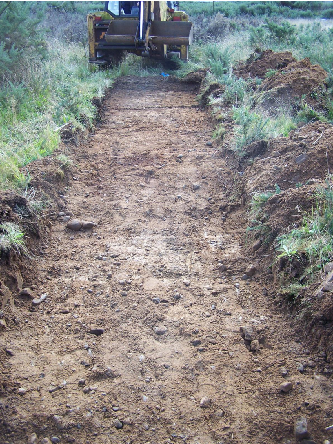
Plate 1: Trench One following excavation to the surface of the natural subsoil (Context No. 102) looking south-east.