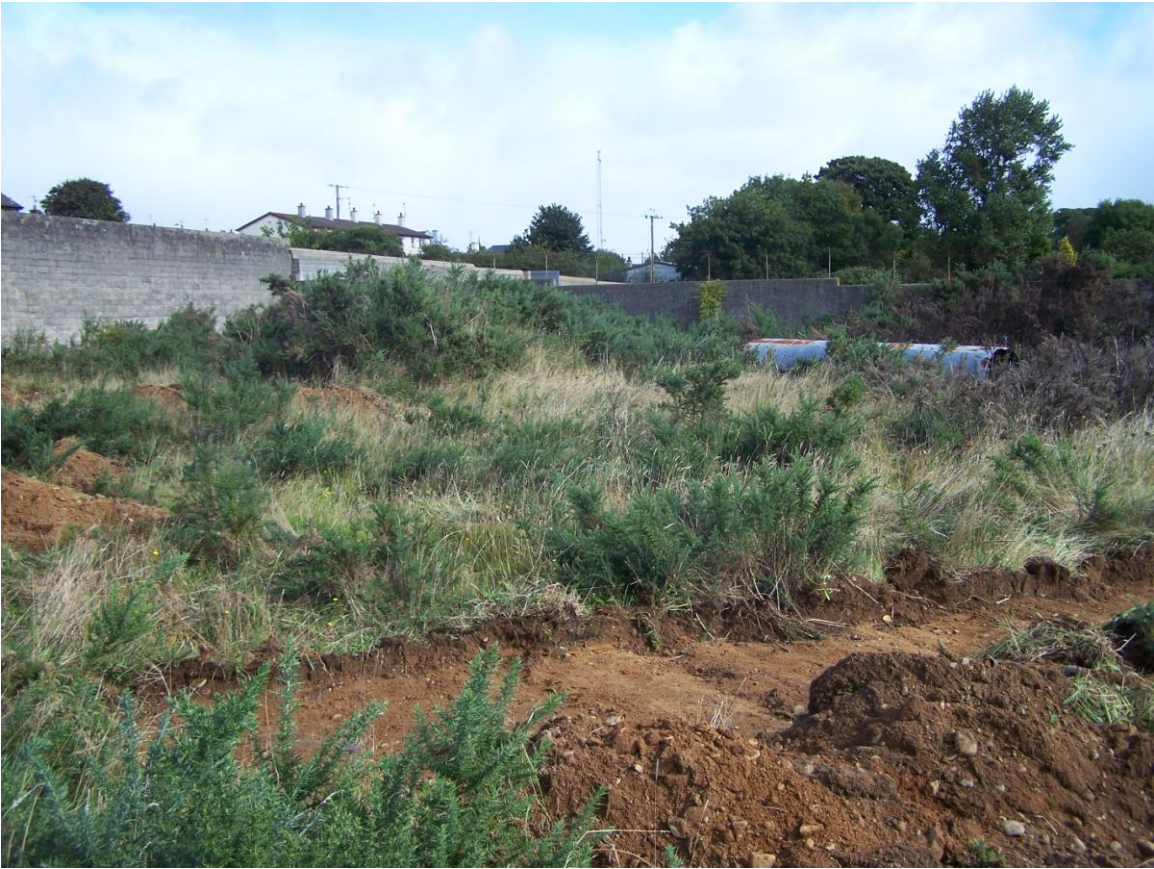
Plate 5: General view of the application site with Trench 5 in the foreground, looking north.