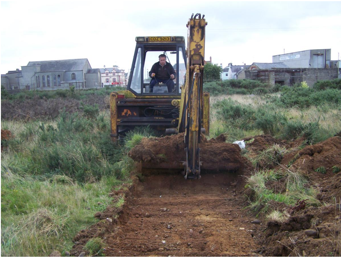
Plate 2: Mid-excavation shot of Trench 2, looking north-west.