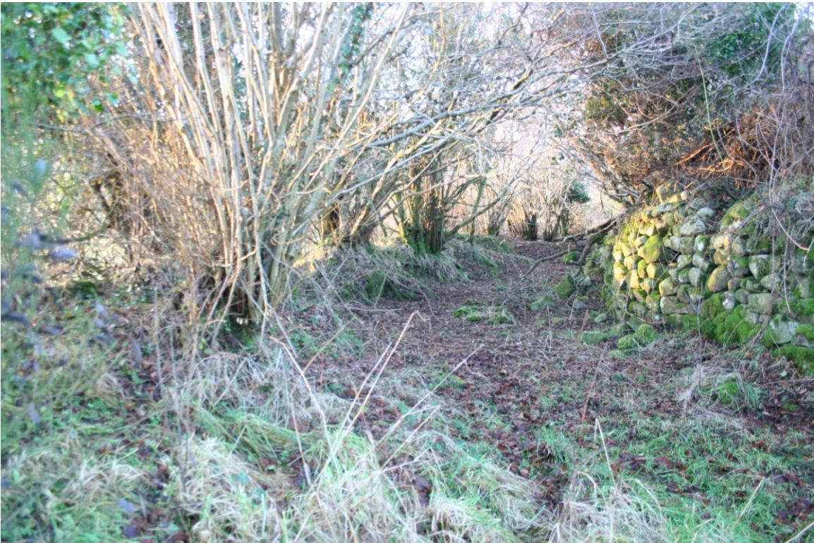
Plate 9: Section of Dane's Cast adjacent to field containing Trench 5, looking north-west.