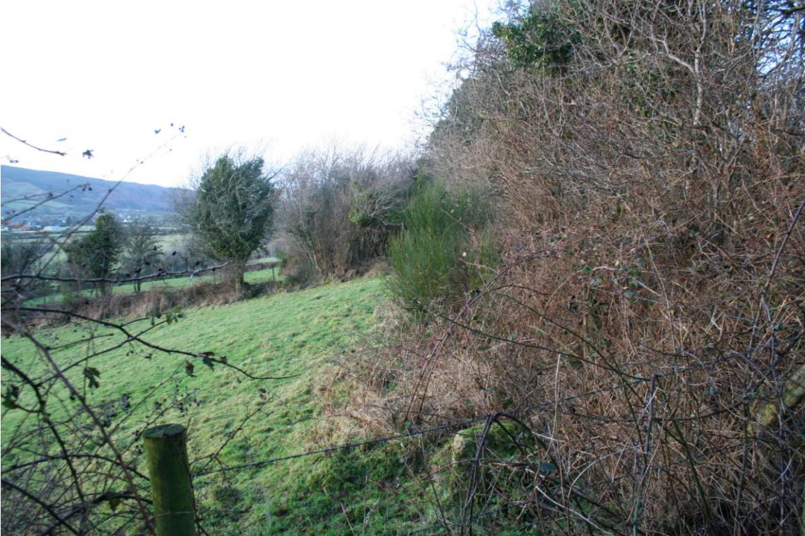
Plate 10: Gap in monument between section in Plates 6 and 7 and section in Plates 8 and 9, hedge on the right is the field boundary, looking north-west.