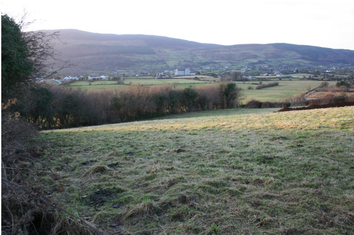
Plate 11: View of the field in which Trenches 1 to 4 were located; just beyond the hedge running through the plate is a section of the Dane's Cast, with Meigh in the background, looking north-west.