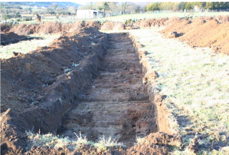
Plate 3: Trench 3, looking north-west.