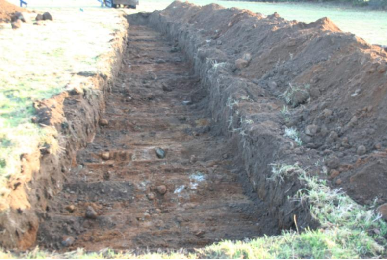
Plate 4: Trench 4, looking south-east.