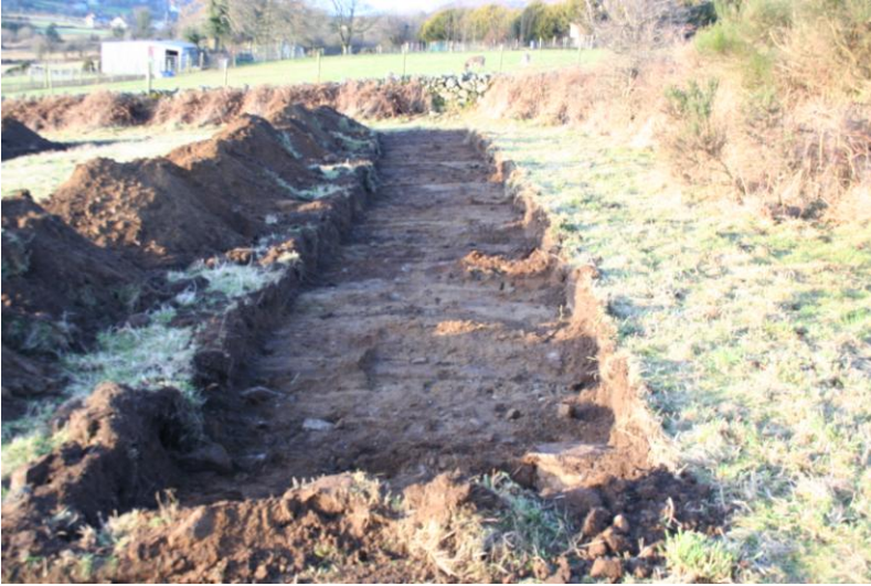
Plate 1: Trench 1, looking north-west.