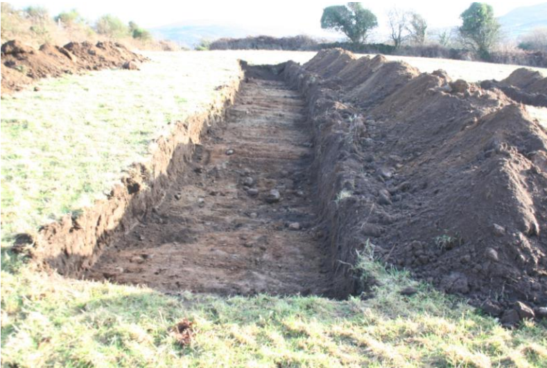
Plate 2: Trench 2, looking south-east.