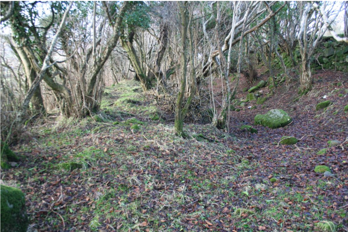
Plate 7: Section of Dane's Cast adjacent to field containing Trenches 1 to 4, looking north-west.