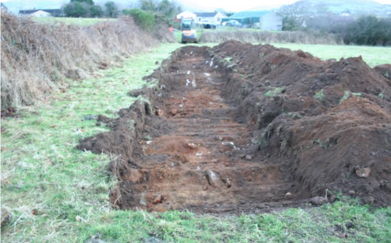
Plate 5: Trench 5, looking south-east.