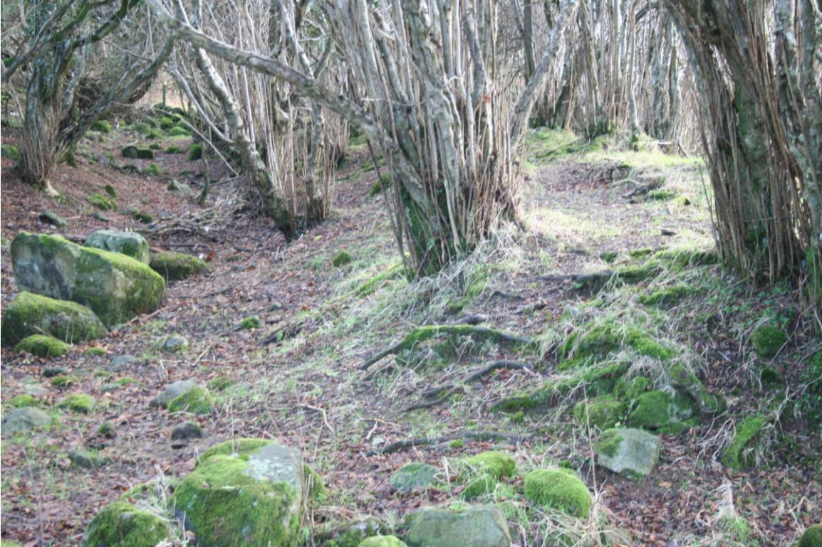
Plate 6: Section of Dane's Cast adjacent to field containing Trenches 1 to 4, looking south-east.