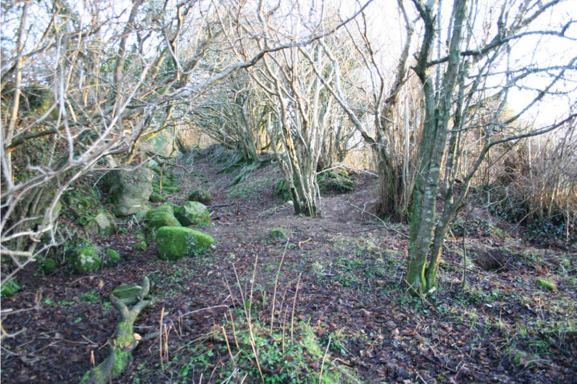
Plate 8: Section of Dane's Cast adjacent to field containing Trench 5, looking south-east.