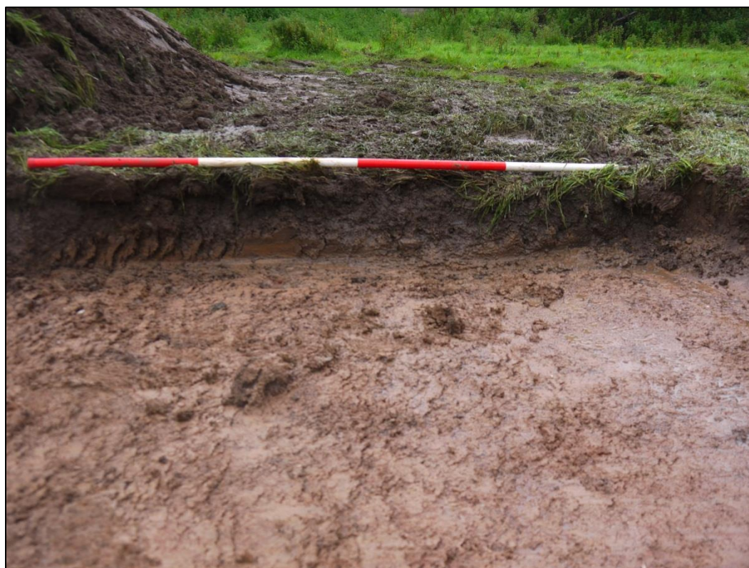
Plate 2: West facing section showing Context No. 101 and 102