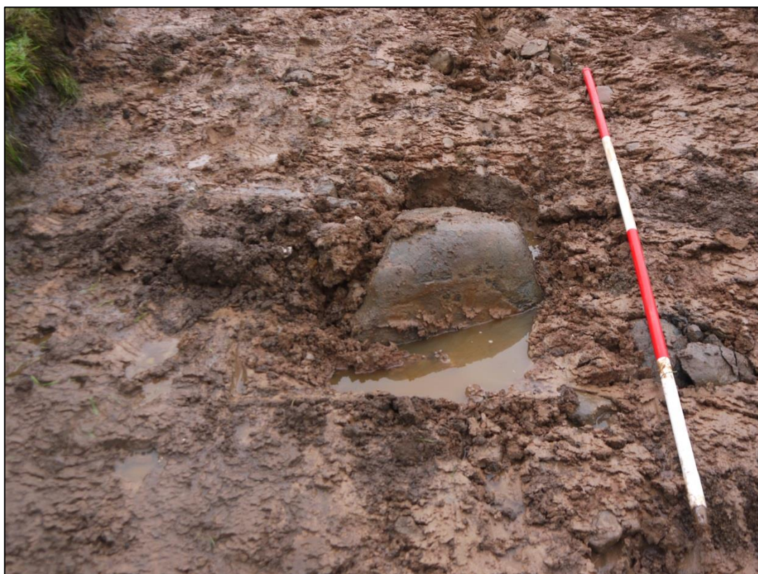
Plate 4: Example of large boulders present in the subsoil (Context No. 102)