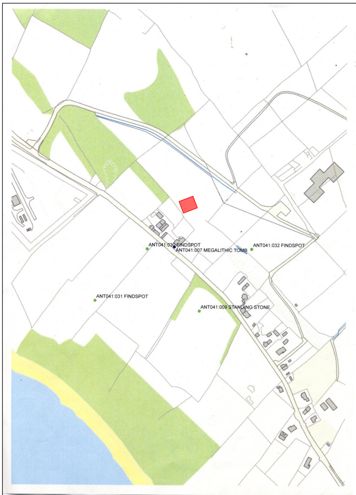
Figure 2: Site location (highlighted in red) in relation to the surrounding scheduled monuments