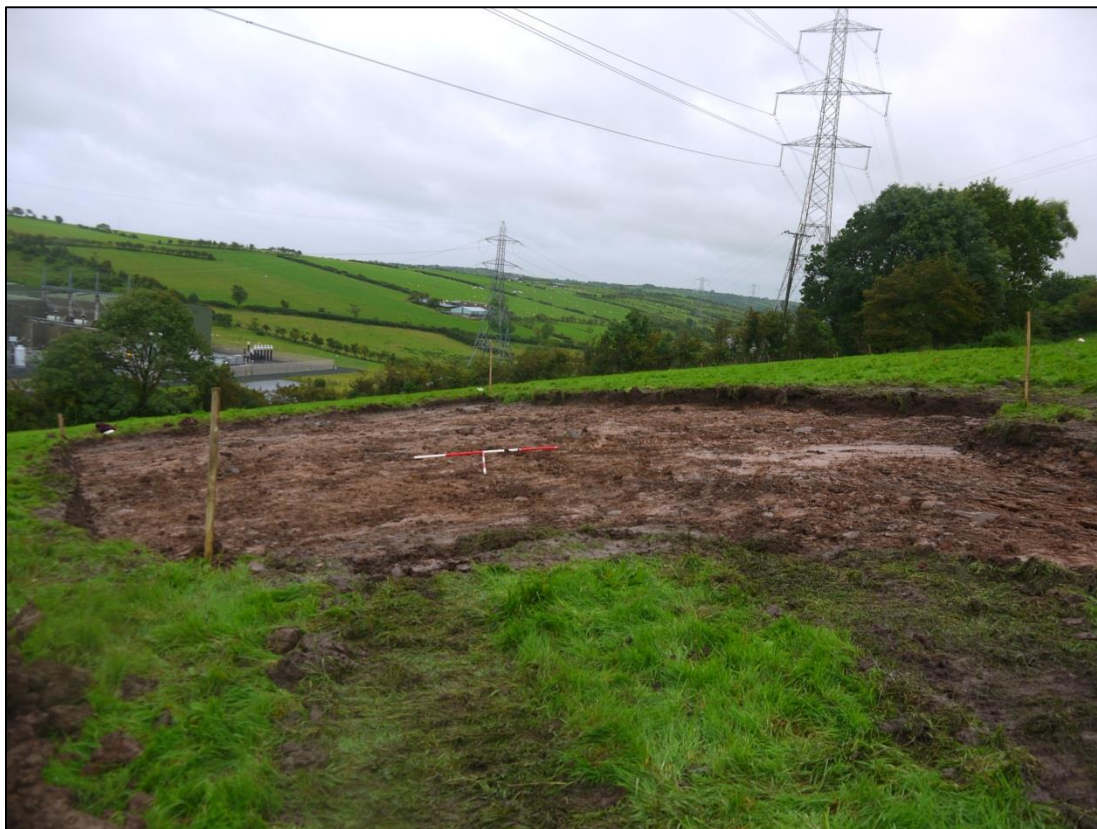
Plate 3: Site after topsoil stripping looking east