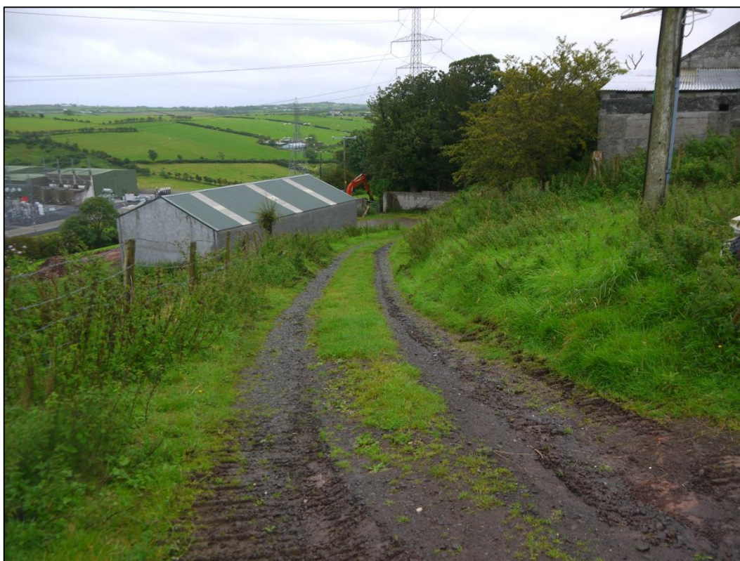
Plate 9: Existing laneway leading to site (area next to fence already hardcored but overgrown)