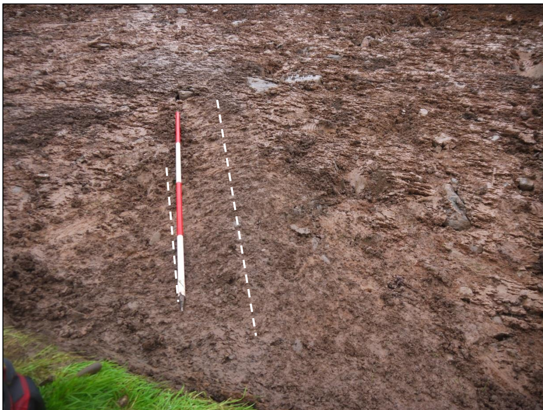
Plate 5: Linear feature (Context no. 103) looking south-west