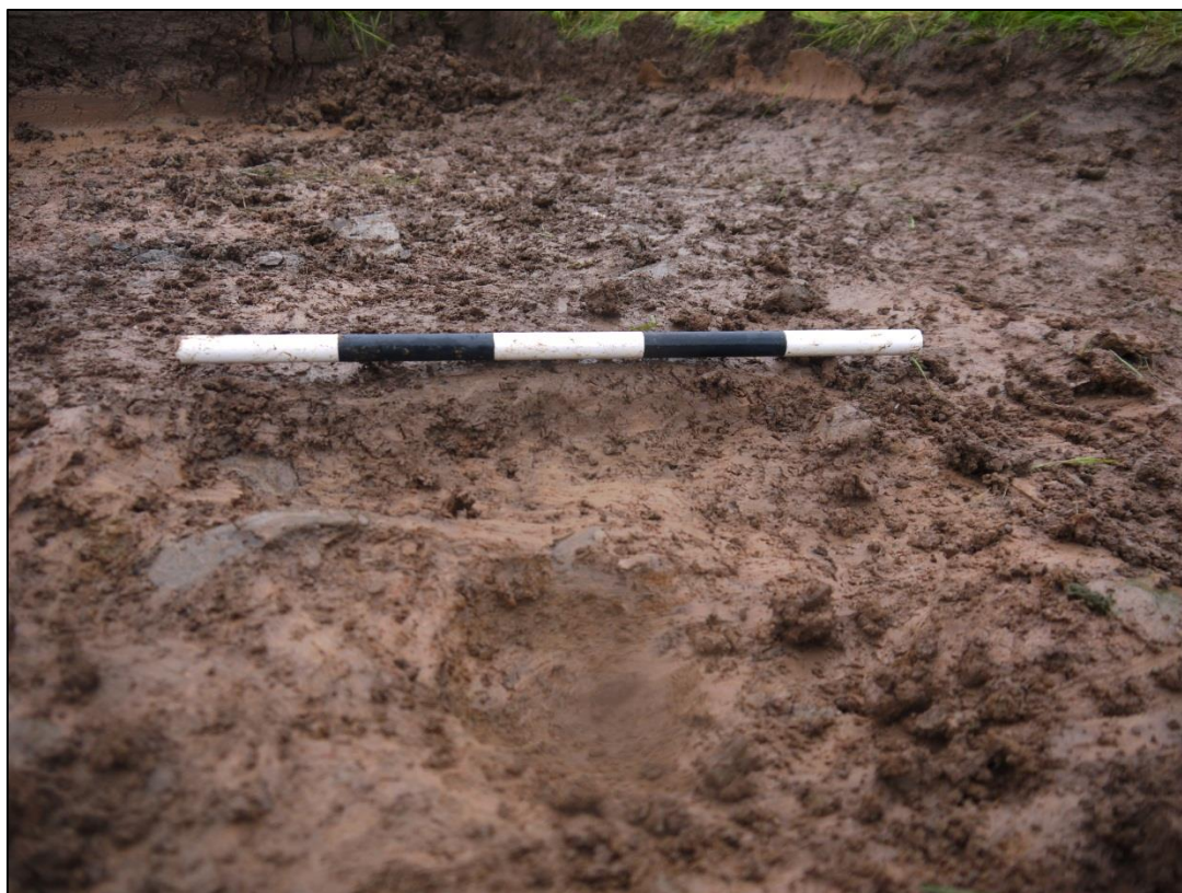
Plate 6: South-west facing section through linear feature (Context no. 103)