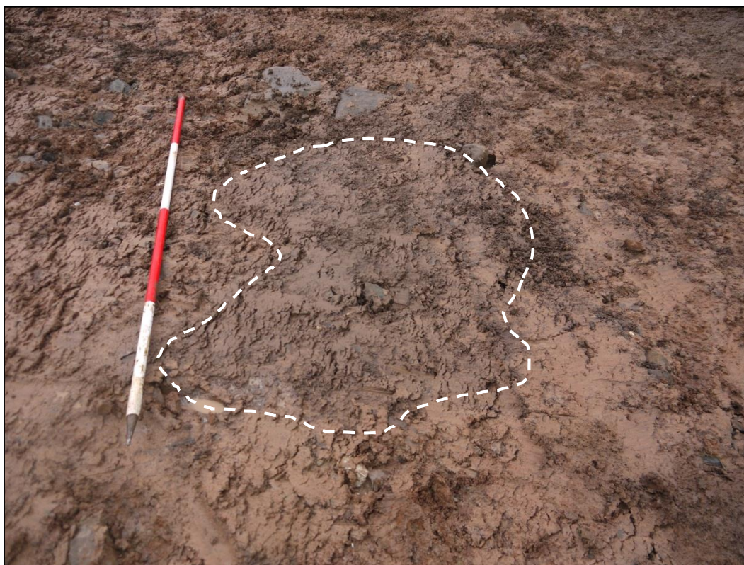
Plate 7: Sub-circular feature (Context no. 103) looking north-east