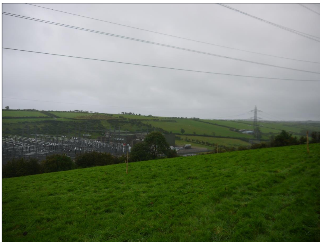
Plate 1: Site prior to excavation