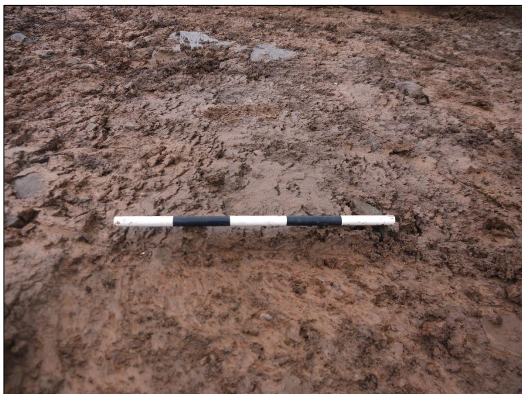
Plate 8: South-west facing section through sub-circular feature (Context no. 103)