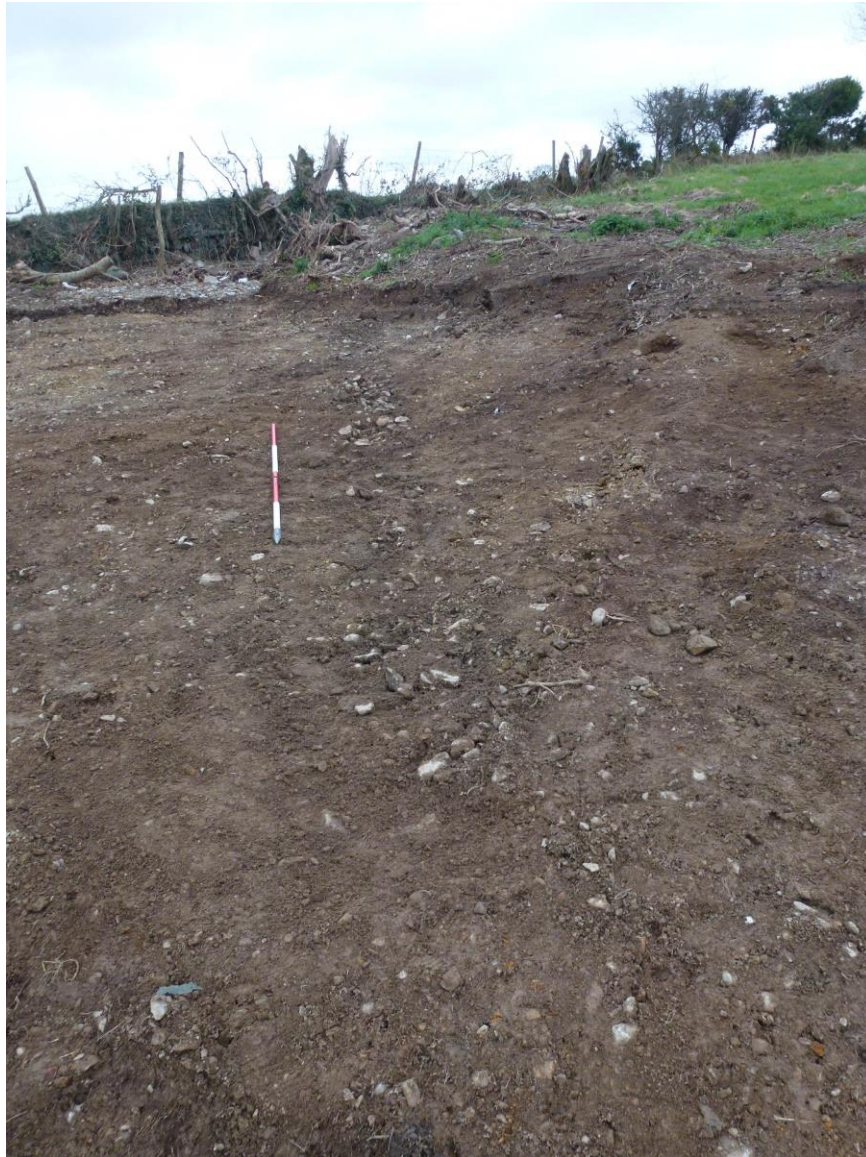
Figure Six: the truncated field drain (507) following mechanical excavation of the topsoil and cultivation soil (502), looking north. Scale 2.0 metres.

order to create a comparatively level area (Figure Five). Within this garden area survived the bases of two truncated features: a field drain (507) and one of the trenches that had been excavated in 2012 (i.e. Trench 4 - which was awarded the context number 504). No features were present in the surface of the subsoil in the exposed area of the field above the line of the hedge. The line of the former field boundary was visible as a comparatively steep break in slope upon the surface of the natural subsoil. The character of the natural, glacial till subsoil varied markedly across the site. Over a short distance it changed from a relatively stone-free, light grey, very sticky and plastic clay to a stone-rich, orangey brown, sandy clay. 3