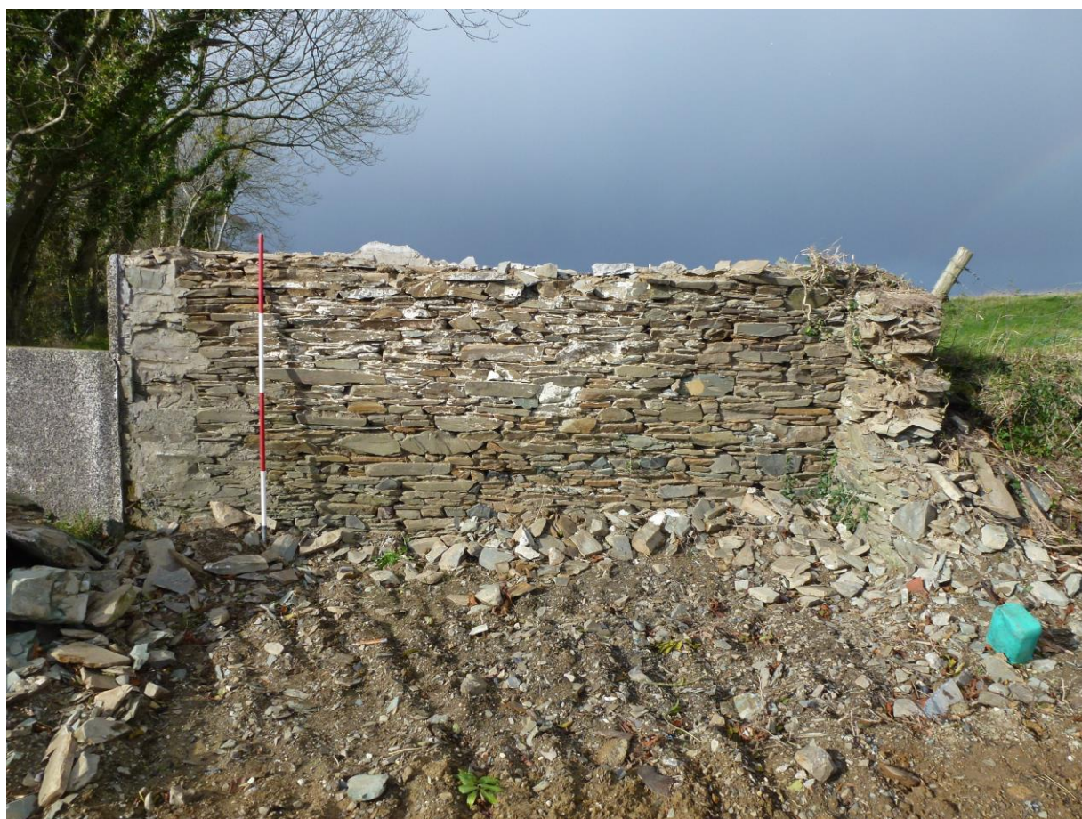
Figure Two: The reduced, northwestern gable of the former property at No.79 Vianstown Road, looking northwest. Scale 2.0 metres.

In 2012, the 'close' proximity of both the castle site and the potentially late medieval farm centre prompted an archaeological evaluation (Licence No. AE/12/43E) at the site of a proposed residential development in the garden (Trench 4) and steeply sloping field (Trenches 1-3) immediately behind a derelict property at 79 Vianstown Road (Mussen 2012). The date of this one-storey property is unknown, however, both it and the triangular-shaped garden to its rear are represented on the first edition Ordnance Survey map of 1834. Examination of the fabric of the surviving part of the building's northwestern gable in 2014 demonstrated that at least that part of the building's masonry was clay bonded suggesting the building's construction may pre-date the nineteenth century (Figures Two and Three). A total of four trenches were mechanically excavated during the course of the evaluation in 2012 (Figure