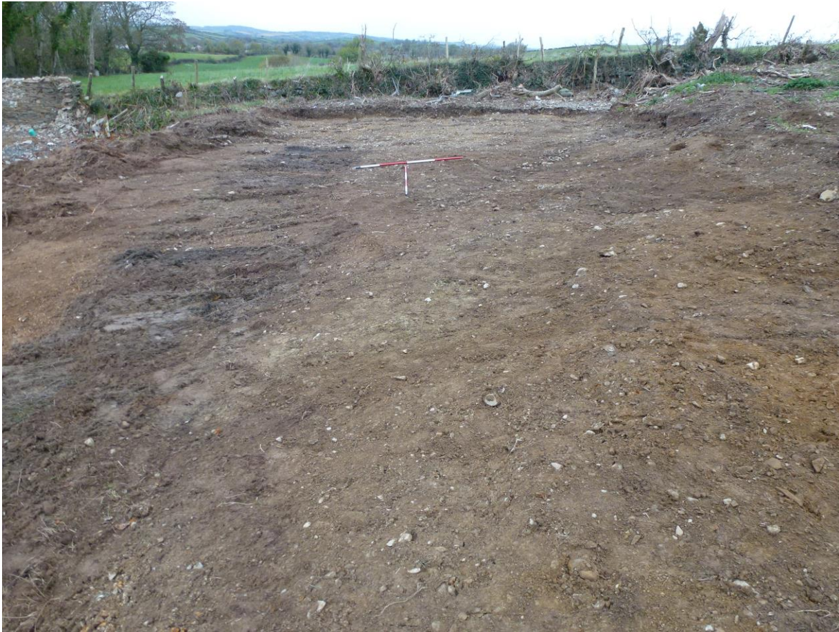
Figure Five: Trench 5 following mechanical excavation of topsoil and cultivation soil (502), looking northwest. To the left of the ranging rods the truncated base of Trench 4 (504) is clearly discernable, to the right of the ranging rods the field drain (507) is also visible. Scales 2.0 metres.

(0.10 to 0.15 metres thick) and contained a frequent amount of small sub-rounded to sub-angular stone inclusions and the occasional larger, plough-marked stone. The presence of the plough-marked stones indicated that the field had previously been cultivated, although today it forms an area of pasture. There was little difference in the character of the two soils, except that the disturbed topsoil excavated within the former garden contained a large number of nineteenth to twentieth century finds, whilst no material culture was recovered from the area of pasture. This marked pattern of finds distribution was consistent with that identified during the 2012 evaluation, where all of the finds were recovered from Trench 4 (located in the former garden) and not Trenches 1, 2 and 3 (all located within the adjacent field) cf. Mussen 2012, 3-4. The finds recovered in 2014 from the disturbed topsoil (502) included: ceramics (mostly blackware, transfer-printed pottery and tile fragments), window and bottle glass, ironwork (mostly structural fittings), copper alloy items of harness and a plastic ice-cream spoon. No finds demonstrably of eighteenth century or earlier date were identified, although it should be noted that some of the sherds of blackware may predate the nineteenth century. The collected artefact assemblage was not awarded find numbers or retained.