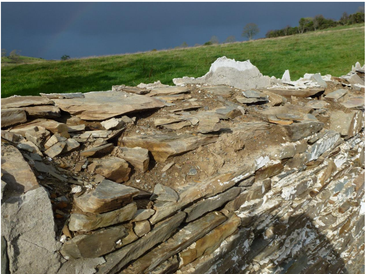
Figure Three: Part of the clay-bonded northwestern gable of the former property at No.79 Vianstown Road, looking north.