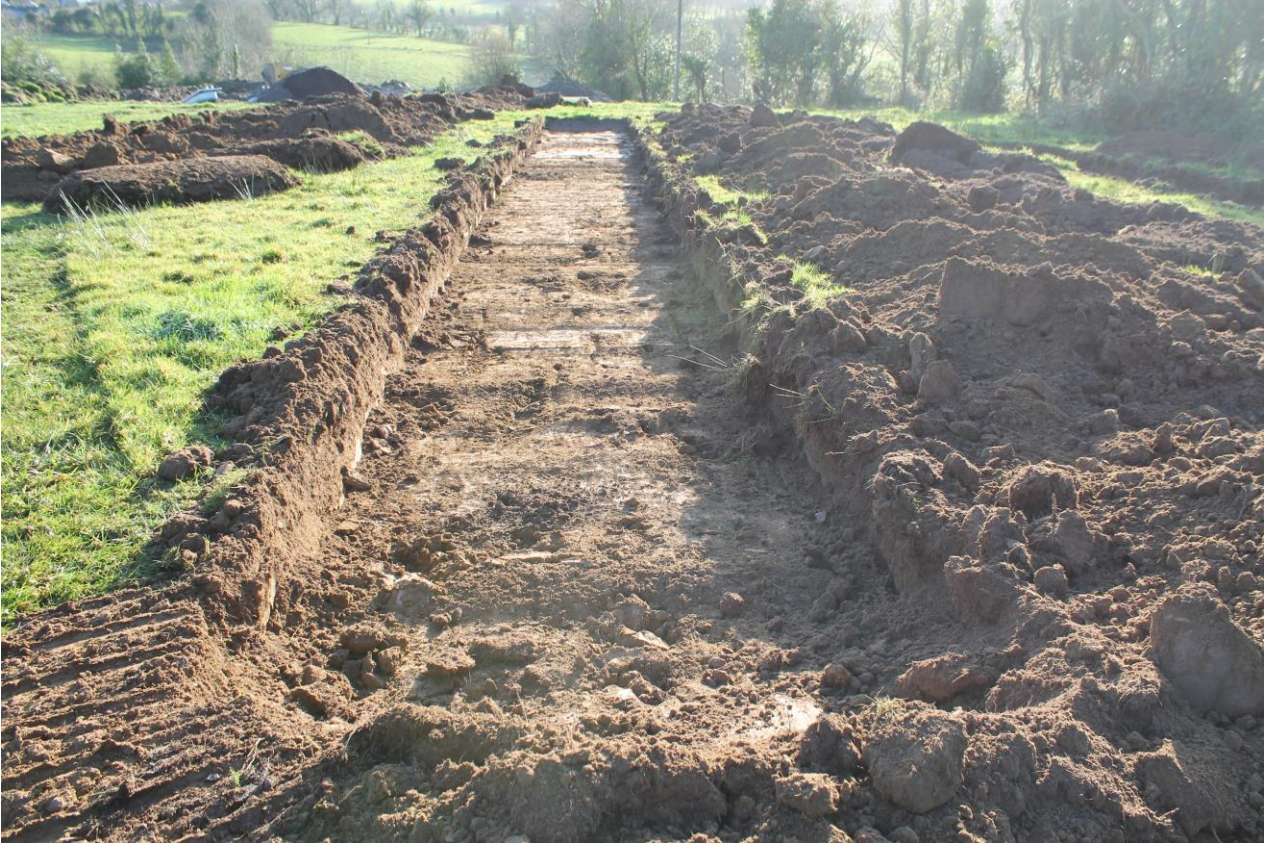
Plate 3: Trench 2, post-excitation, looking south-east.