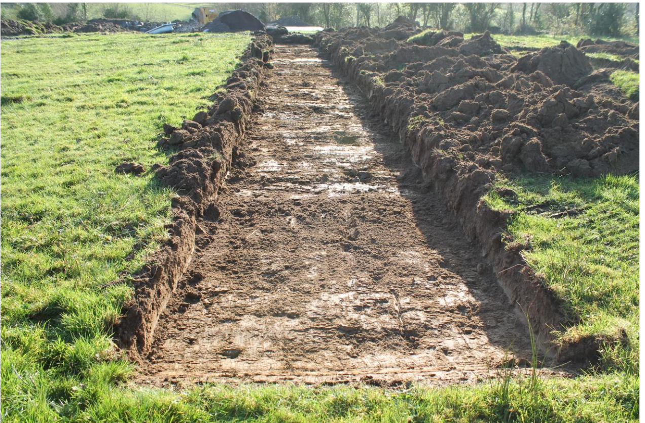
Plate 4: Trench 3, post-excitation, looking south-east.