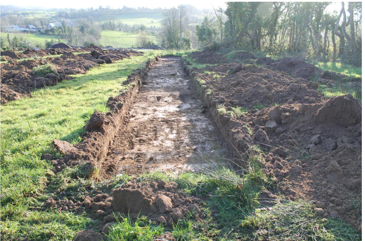
Plate 2: Trench 1, post-excavation, looking south-east.