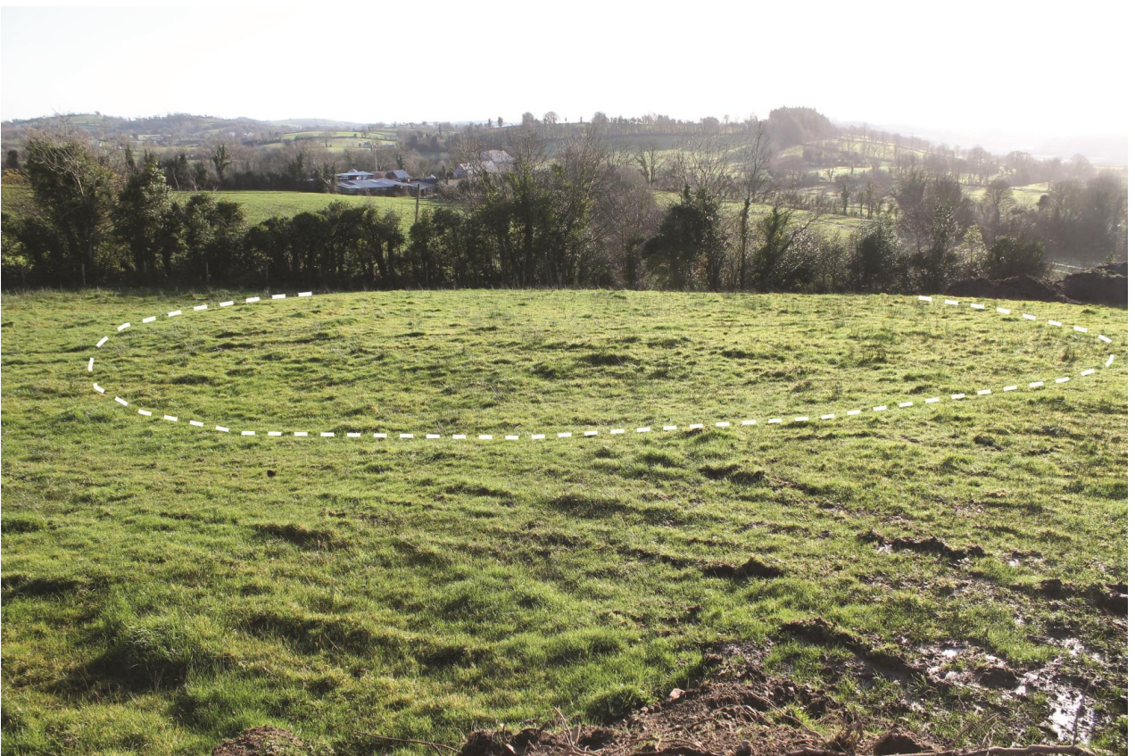
Plate 1: FER 191:101, with approximate outer limits highlighted, looking south-east.