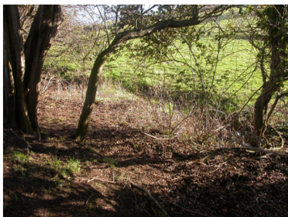
The leat channel from the mound, looking southeast.

It is difficult to reconstruct the form of the mill from the surviving remains. It is reasonable to suggest that the mill's wheel was located adjacent to the mound in the dried-up channel, which would have formed the mill's leat and tail race. Given the longitudinal alignment of the mound, the wheel was presumably mounted onto the side of the building, rather than a gable end. The apparent remains of a denuded stone structure within the stream at a point opposite the mound poses a problem of interpretation. If this was the remains of a wheel pit then either the mill had two wheels, or the stream and leat have been misidentified. Alternatively, it is possible that the apparent stone structure represents elements of the mill building that have collapsed into the stream.