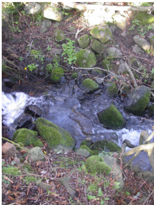
The denuded remains of a stone structure within the stream adjacent to the mound, looking north.

On archaeological and cartographic evidence alone, the precise date of the watermill is uncertain. Given that the stream which supplies it is integrated into the current field system, then the construction of the mill cannot pre-date the laying out of the current field system. The date of the field system itself is unknown, although it is reasonable to assume that it does not pre-date the late sixteenth century. As the cartographic evidence indicates that the mill had been demolished by 1833 (see above), then the mill probably dates to some point between the late sixteenth and early nineteenth century. It is tempting to suggest that the watermill is one of those recorded as being in 'Ballyrather' in a 1635 Inquisition Post-Mortem as being formerly owned by a David Buthill de Glandrine and who had been succeeded by a Randolph Buthill (Inq. Ulst. Antrim Car.I (40)). Randolph Buthill is presumably the Randle Brittle whose house and parcel of 'Ballruder' / 'Ballrudery' are respectively depicted on the extant copies of the maps of the Parish of Cairncastle and Barony of Glenarne that were prepared as part of the Down Survey c.1656-68 (NISM No. ANT 035:087).