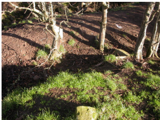
The mound upon which the watermill building was built (background) and the westernmost part of the leat channel (foreground), looking northeast.

that the watermill building would have been built upon the top of the mound.