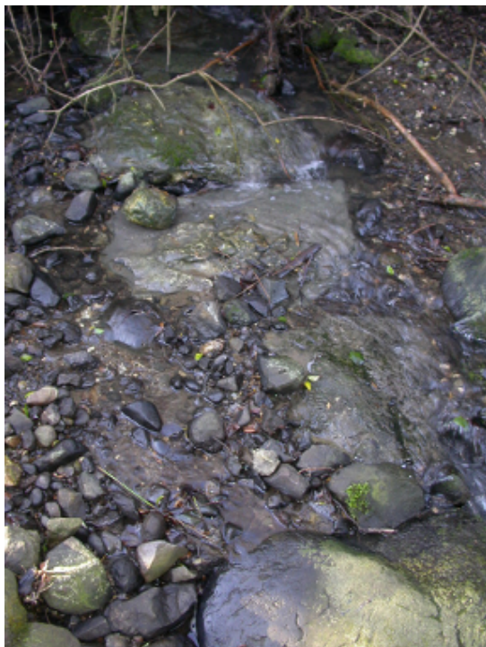
The ford, looking westsouthwest.

Where the probable wrack road crosses the stream that defines the field's northern boundary, a ford of large stone slabs had been built. Although the area around the ford is now overgrown it was possible to take some photographs of the feature. The ford consisted of at least six or seven large flat slabs neatly laid as lintels over a channel with an estimated depth of at least 0.15 metres. During the course of the site visit it was not possible to ascertain how the lintel slabs were supported, or whether the base of the channel also consisted of laid slabs.