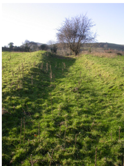
The cutting associated with the wrack road, looking up slope (westsouthwestwards).

On archaeological and cartographic evidence alone, the precise date of the watermill is uncertain. Given that the stream which supplies it is integrated into the current field system, then the construction of the mill cannot pre-date the laying out of the current field system. The date of the field system itself is unknown, although it is reasonable to assume that it does not pre-date the late sixteenth century. As the cartographic evidence indicates that the mill had been demolished by 1833 (see above), then the mill probably dates to some point between the late sixteenth and early nineteenth century. It is tempting to suggest that the watermill is one of those recorded as being in 'Ballyrather' in a 1635 Inquisition Post-Mortem as being formerly owned by a David Buthill de Glandrine and who had been succeeded by a Randolph Buthill (Inq. Ulst. Antrim Car.I (40)). Randolph Buthill is presumably the Randle Brittle whose house and parcel of 'Ballruder' / 'Ballrudery' are respectively depicted on the extant copies of the maps of the Parish of Cairncastle and Barony of Glenarne that were prepared as part of the Down Survey c.1656-68 (NISM No. ANT 035:087).