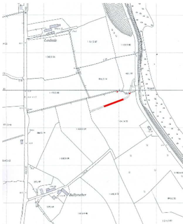
Map showing the position of the watermill (A), cutting associated with the wrack road (B) and ford associated with the wrack road (C) (after the OS 1967 revision of the 1:2500 survey).

The hitherto unrecorded sites of a watermill, a cutting associated with a probable wrack road and a ford, have been discovered during fieldwork by one of the authors (SC) on Ballyruther Farm, near Ballygally, Co. Antrim. This report briefly describes the sites and is based upon a visit to the site undertaken by the authors in January 2009. All three sites are located within the northern half of a field used for pasture on Ballyruther Farm. The field is roughly rectangular in shape and located on a steep slope overlooking the Coast Road. Locally known as the 'Cove Field', the field is currently used for pasture. It is bisected by the eastnortheast-west southwest aligned cutting associated with the probable wrack road. The area to the north of the probable wrack road, which contains the watermill site, shows no evidence for cultivation. The remainder of the field (to the south of the probable wrack road)